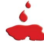
Severe pain and shock