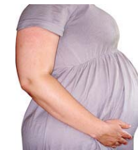
A woman with FGM is more likely to have a difficult labour and this puts the life of mother and baby in danger