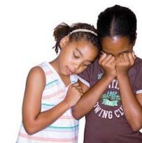
Women and girls with FGM often feel sad and depressed.