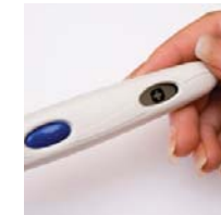
Infections could stop you from getting pregnant